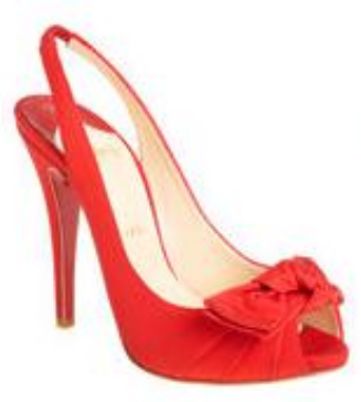
Christian Louboutin Lady Bow $735.00