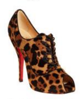
Christian Louboutin Lady Derby $1,175.00