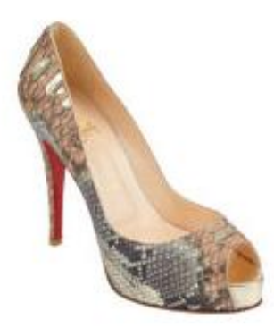
Christian Louboutin Python Very Prive $1,255.00