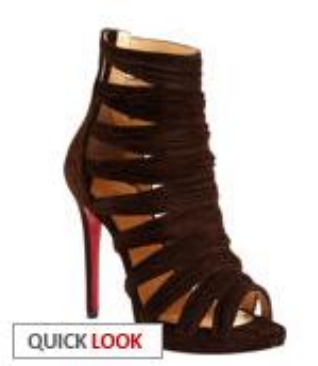
Christian Louboutin Tinazata $1,395.00