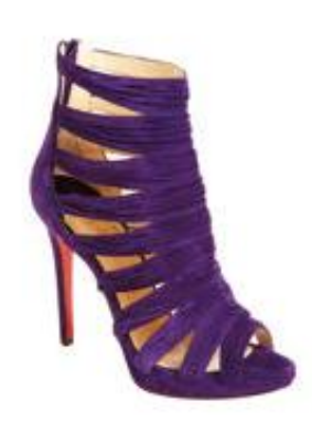
Christian Louboutin Tinazata $1,395.00