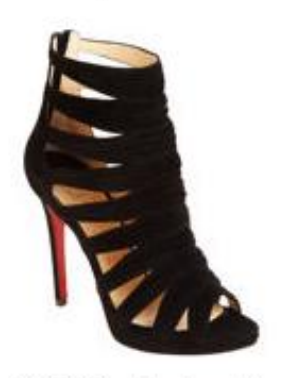
Christian Louboutin Tinazata $1,395.00