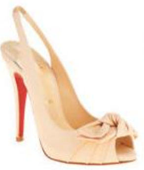
Christian Louboutin Lady Bow $735.00