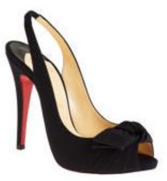
Christian Louboutin Lady Bow $735.00