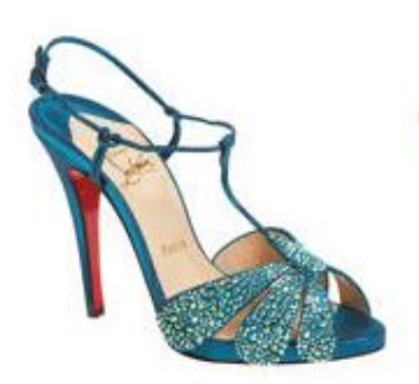
Christian Louboutin Margi Diams Strass $1,995.00